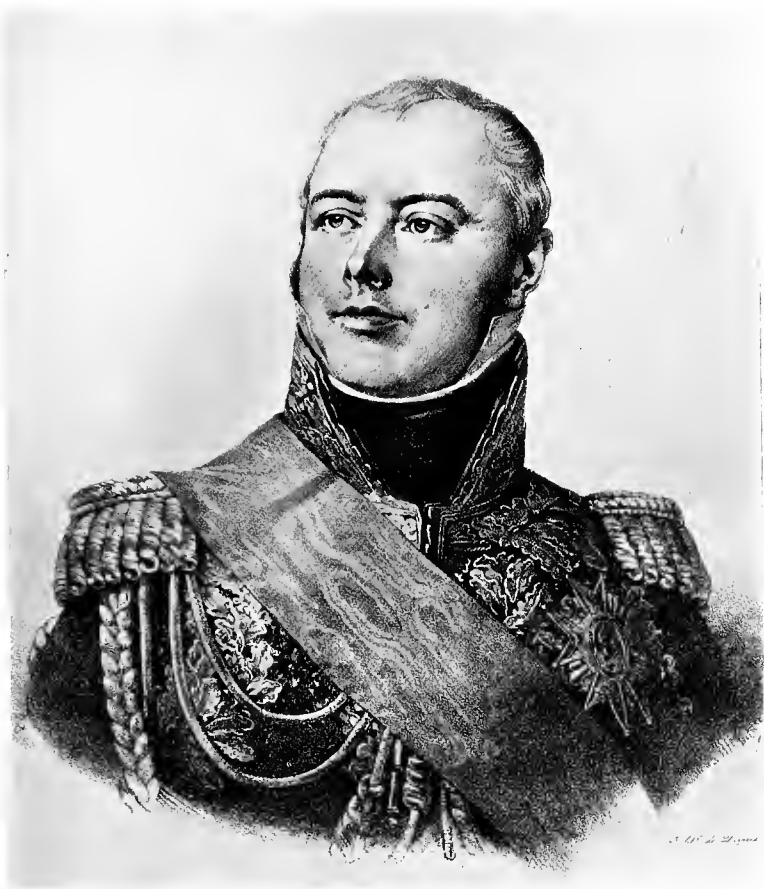
JACQUES ETIENNE MACDONALD, DUKE OF TARENTUM FROM A LITHOGRAPH BY DELPECH